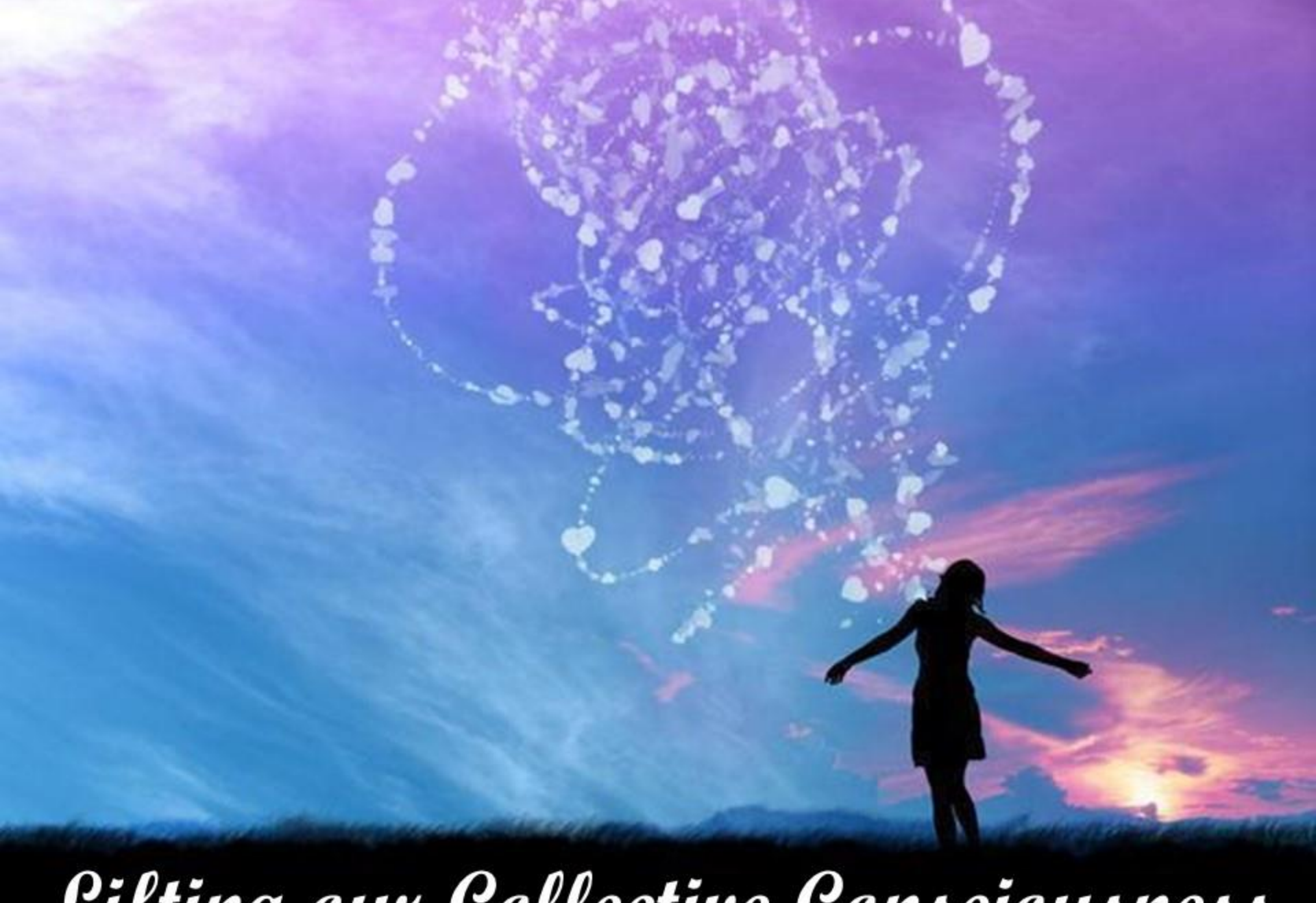
Lifting our Collective Consciousness