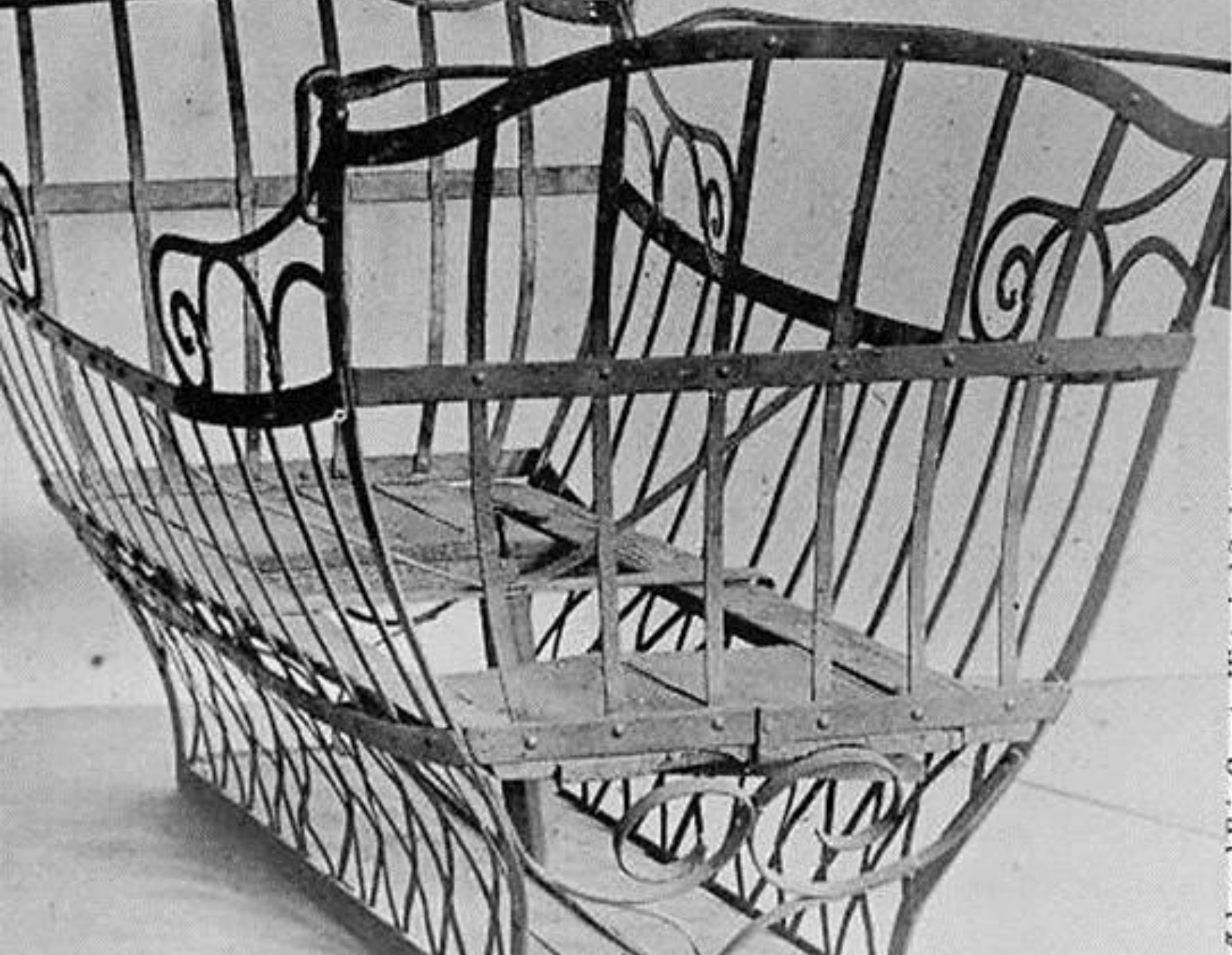
Buffalo and Erie County Historical Society